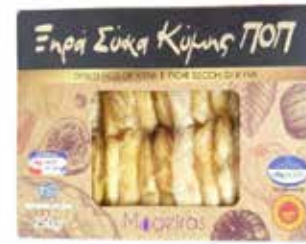
Dried Figs "Mageiras" 250g