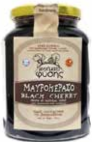
Spoon sweet Black Cherry "Gennimata Fysis" jar 450g