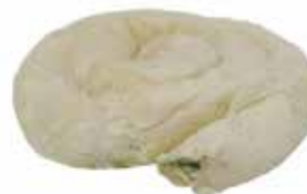
Snail pie with spinach & cheese 220gr (40pcs/carton)