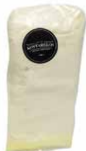
Soft feta Kostarelos vaccum aprox 1kg