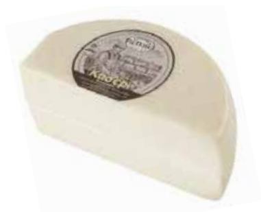
Semi hard Yellow Cheese (Kaseri) "Arvanitis" wheel approx 4kg