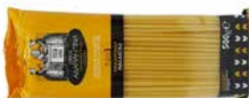
Pasta Makaroni "Adamantina" No3 500g