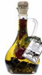
EVOO Chilli Pepper Flavors "Elaia&Co" 250ml Code: D3330 Unit of Measurement: Piece Packaging: 12PCS/CARTON