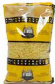
Greek orzo "kritharaki" "Adamantina" THIN 500g