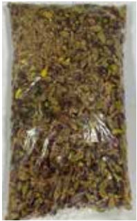
Pistachios slices raw "Batavia" 1kg