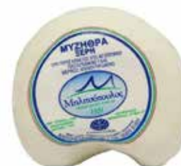
Myzithra dry "Miltisopoulos" wheel approx 1kg