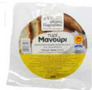
Manouri Cheese "Parnassos" 200g Code: R3056 Unit of Measurement: Piece Packaging: 12PCS/CARTON