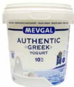
"Mevgal" Greek strained cow's yogurt 10% fat 900g Code: R3422 Unit of Measurement: Piece Packaging: 6PCS/CARTON