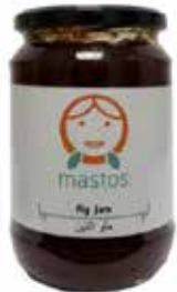
Fig marmelade "Mastos" 900g