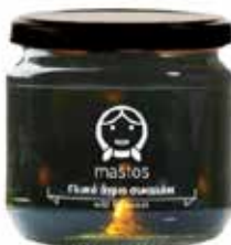
Spoon sweet Wild Fig "Mastos" 900g