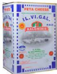
Feta Cheese PDO IL.VI.GAL. "Kalomoiris" tin approx 15kg