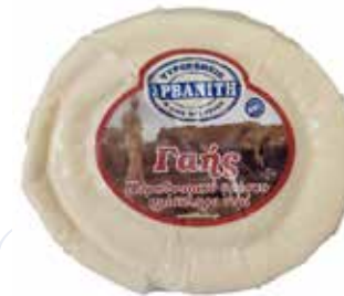
Gais cheese "Arvanitis" vaccum aprox 500g Code: R3632 Unit of Measurement: Kg Packaging: 12PCS/CARTON