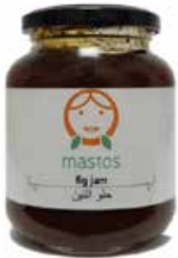
Fig marmelade "Mastos" 450g