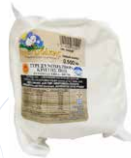
Sour myzithra "Vogatzidakis" 500g Code: R1617 Unit of Measurement: Piece Packaging: 50PCS/CARTON