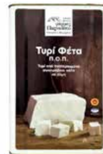
Feta Cheese "Parnassos" PDO From 100% Sheep's & Goat's milk tin approx. 15kg