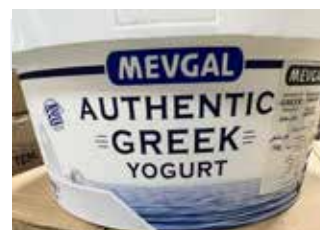
"Mevgal" Greek strained cow's yogurt 10% fat 5KG Code: R3637 Unit of Measurement: Piece Packaging: 5KG