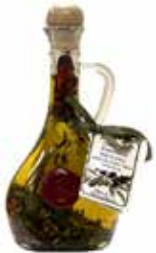
EVOO Cretan Flavors "Elaia&Co" 250ml Code: D3328 Unit of Measurement: Piece Packaging: 12PCS/CARTON