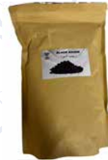
Black Raisins "Gargaronis" 1Kg