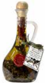
EVOO Mediterranean Flavors "Elaia&Co" 250ml Code: D3327 Unit of Measurement: Piece Packaging: 12PCS/CARTON