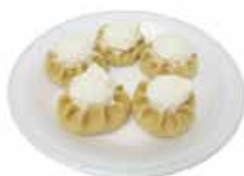
Kalitsouni Lychnaraki 6kg