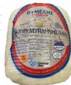
Ladotyri Cheese from Mytilinis Island wheel approx 1kg