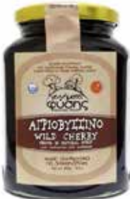
Spoon sweet Wild Sour Cherry "Gennimata Fysis" jar 450g