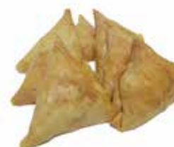
Spinach cheese pie mini triangular 6kg