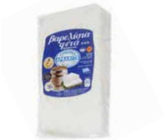
Barrel Feta "Arvanitis" vacum approx.500g Code: R1033 Unit of Measurement: Kg Packaging: APPROX 10KG/ CARTON