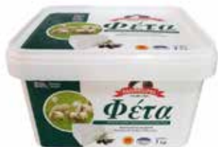
Feta Cheese PDO IL.VI.GAL. tuper 1kg