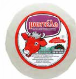
Mastello cheese from cow's milk, wheel aprox 400g