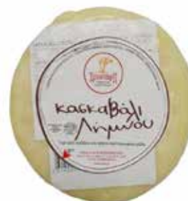
Kaskavali Limnou Cheese "Xrysafis", from sheep's and goat's pasteurized milk, wheel approx 700g