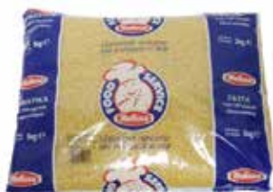
Pearl barley medium (Greek orzo "kritahraki" (vegetarian) "Melissa" 3kg)