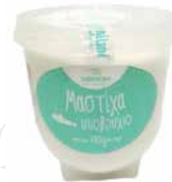
Submarine with masticha flavour 700g