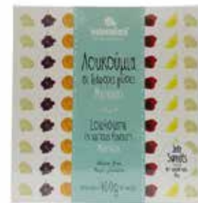
Loukoumi in various flavors "Loukoumiland" 400g