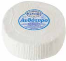
Anthotyro white soft Cheese "Arvanitis" wheel aprox 2.8kg Code: R1309 Unit of Measurement: Kg Packaging: 4PCS/CARTON