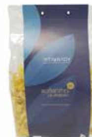
Pasta with Saffron (chylopites) BIO 400g