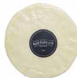
Melipasto cheese "Kostarellos" approx 400g Code: R3086 Unit of Measurement: Kg Packaging: 30PCS/CARTON