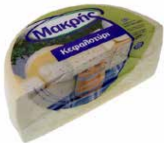
'Kefalotyri Yellow Hard Cheese From Amfilohia "Makris" half wheel aprox 5kg