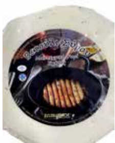
Vetouli cheese "Zozefinos" wheel approx 300g Code: R3349 Unit of Measurement: Kg Packaging: 20PCS/CARTON