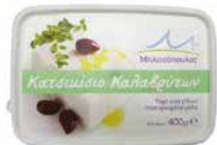
Goat Cheese "Miltisopoulos" tuper 400g