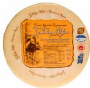
Graviera "EAS Naxou Island" PDO wheel cow's milk approx. 1,2kg