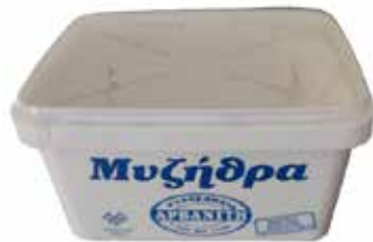
Myzithra cheese "Arvanitis" taper 600g Code: R3631 Unit of Measurement: Piece Packaging: 8PCS/CARTON