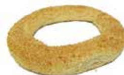
Breadstick koulouri Thessalonikis 80gr