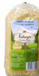
Traditional Sour frumenty "Kalavrita" 500g