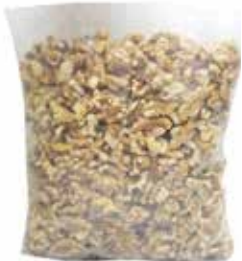
Walnuts Kernel Without Shell from Amaliada 1kg