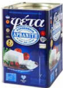
Feta cheese "Arvanitis" tin aprx 15kg Code: R3145 Unit of Measurement: Kg Packaging: 15KG/TIN