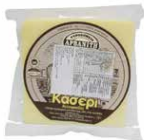
Semi hard Yellow Cheese (Kaseri) "Arvanitis" wheel piece 220g