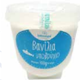
Submarine with vanilla flavour 700g