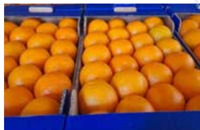
Greek Fresh Oranges box 10 kg