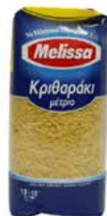
Greek orzo "kritahraki" (vegetarian) "Melissa" 500g