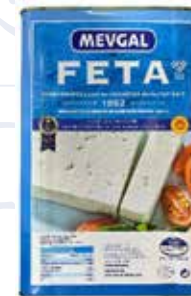
Feta Cheese Mevgal PDO from 100% sheep's and goat's milk tin aprox 15kg Code: R3629 Unit of Measurement: Kg Packaging: 15KG/TIN