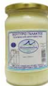
Butter from sheep's & goat's milk "Militsopoulos" jar 500g Code: R1608 Unit of Measurement: Piece Packaging: 12PCS/CARTON