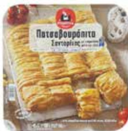
Traditional Pie Santorini (to- mato-feta-olives) rectangular 6pcs