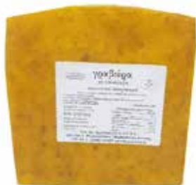
Cheese Graviera with Turmeric "Kostarellos" 250g Code: R3107 Unit of Measurement: Piece Packaging: 50PCS/CARTON