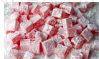
Rose Loukoumi "Vomvylas" per kg ( 5-6KG)