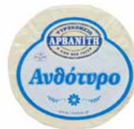
Anthotyro soft white cheese "Arvanitis" from sheep's and goat's milk, wheel approx 300g