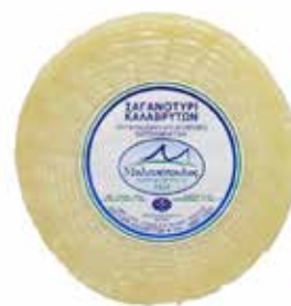
Saganotyri Hard yellow Cheese "Militisopoulos" wheel approx 500g)