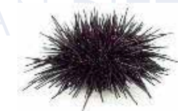
Sea Urchin Eggs jar - Αχιβοι