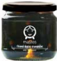
Spoon sweet Wild Fig "Mastos" 460g