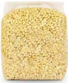
Pine Nuts "Batavia" 1kg