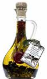
EVOO Greek Flavors "Elaia&Co" 250ml Code: D3329 Unit of Measurement: Piece Packaging: 12PCS/CARTON