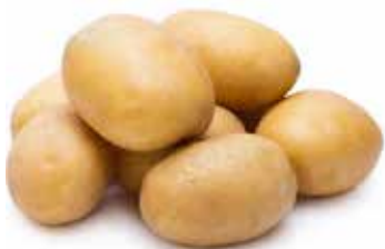
Greek Fresh potatoes "ARGIA" sacket 25 kg