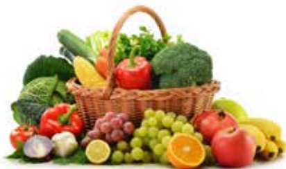
Greek fresh vegies and fruits