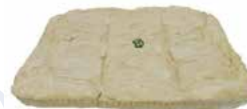
Greek handmade pie with green herbs 1,8kg